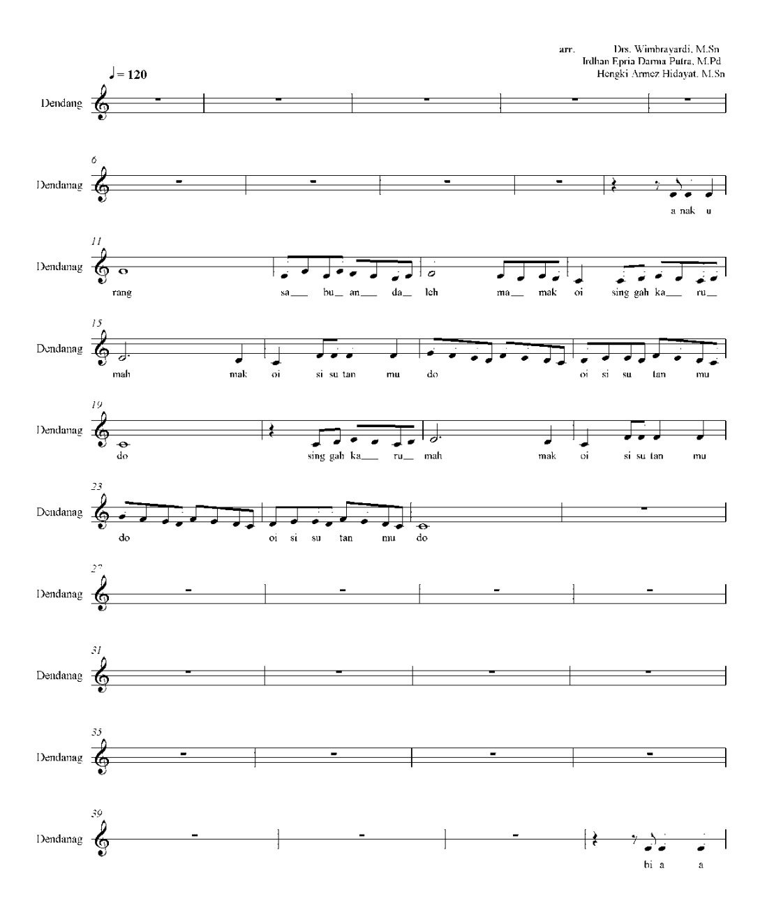
\frac{MUDIAK\ ARAU}{\text{sebuah karya inovatif dalam pelestarian kesenian sikatuntuang di ranah pendidikan}}

musical works as a form of cultural industry in the field of musical works that departs from the Sikantuntuang art: